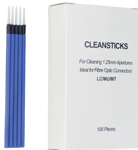
CleanSticks LC 1.25mm Order Code TT00176