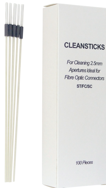
CleanSticks SC/ST/FC 2.5mm Order Code TT00177