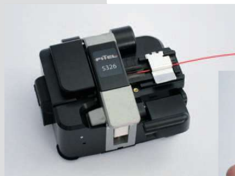
Operation on desktop

With its ergonomic and light weight design, the S326 cleaver offers the operator the versatility to cleave on a work bench or in the palm of their hand. The reduced lid size and wide opening angle facilitates fiber loading and improves stability resulting in better single and ribbon fiber cleaves. Just pressing the lever completes the fiber cleave and automatically collects the waste. With 24 positions, the long life-time blade achieves 48,000 fiber cleaves. The S326 cleaver can offer optical fiber cleaving for a full range of OSP and OEM applications. The S326A configuration comes with both the regular and large size fiber waste bin or users can choose the smaller S326B option without a bin.