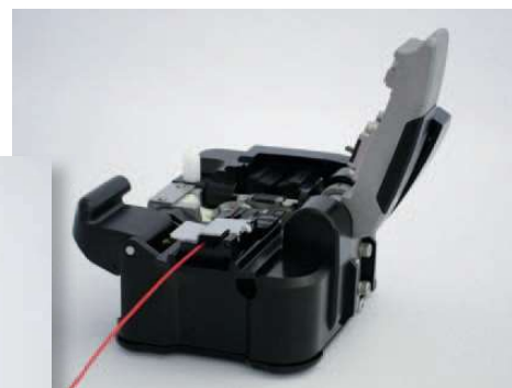
Wide lid opening angle