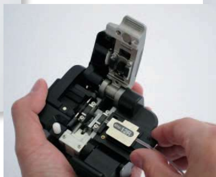
Operation on hand