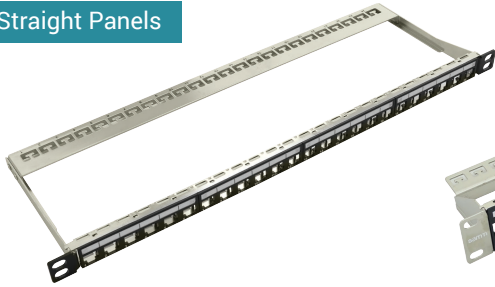
UHD ½U - 24 Ports