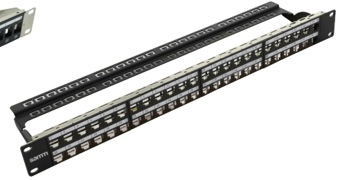
UHD 1U - 48 Ports