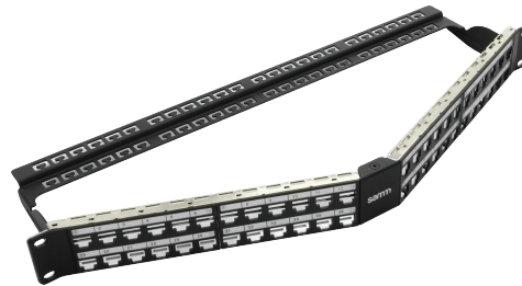
UHD 1U - 48 Ports