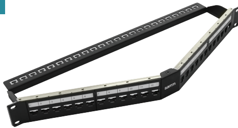
HD 1U - 24 Ports